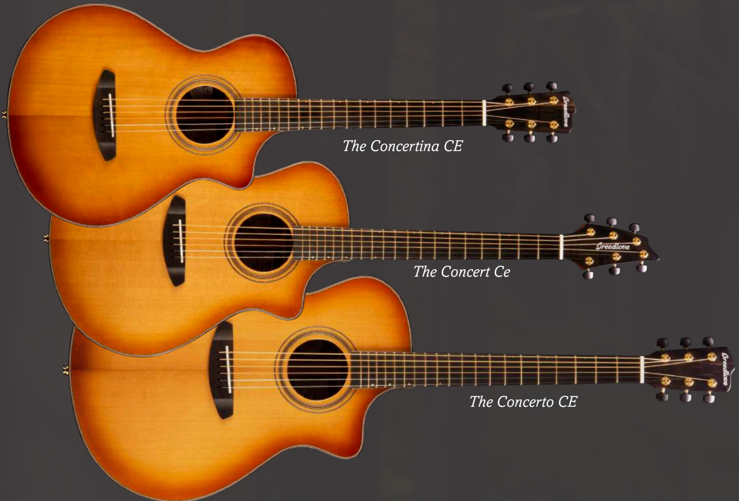
The Concertina CE

Myrtlewood grows in Oregon along a 90 mile stretch of the Pacific Ocean coast. It is Breedlove's favorite tonewood for backs and sides as it delivers surprising energy and extraordinary tonal balance in addition to its highly varied color patterns extenuated by the thin Natural Shadow Burst finish. To further boost the High-Energy sound we have chosen a Hard Rock maple neck, which is denser than mahogany, and an African ebony fretboard and bridge. Of course, the top is torrefied European spruce for the rich aged sound of a guitar built decades ago. Nothing had been spared including brass inlays, gold frets and tuners, Breedlove Natural-Sound Electronics. All Solid Wood & Sustainably Harvested.